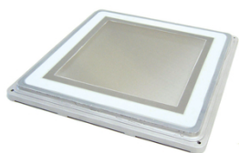
Trampoline Mounted Screen