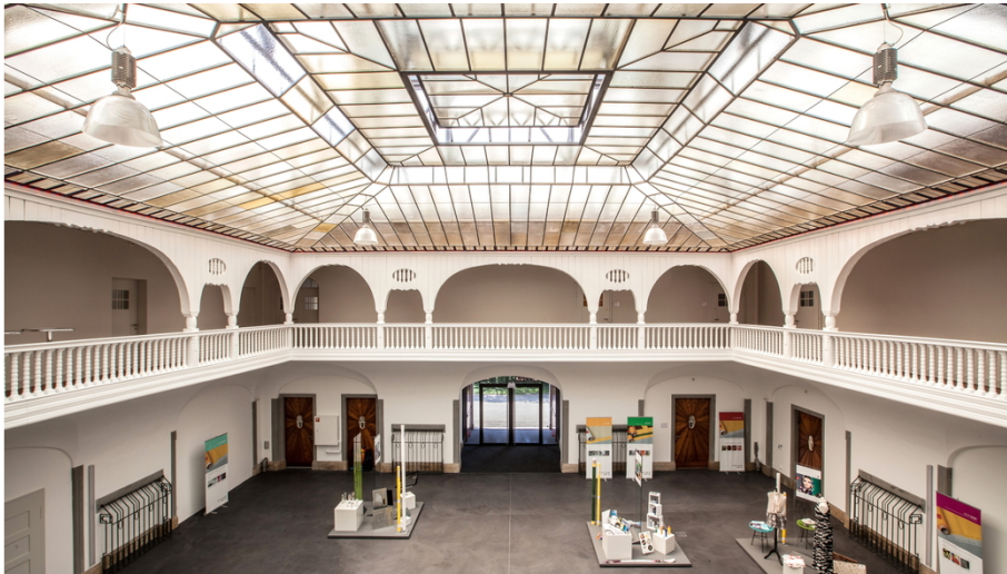
Sefar Competence & Training Center, Screen Printing

The intensive screen printing course covers a wide range of topics, from mesh selection and its impact on the print result, to the intricacies of the stretching process and how to optimize the printing process.