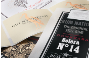
© Marbau GmbH & Co. KG