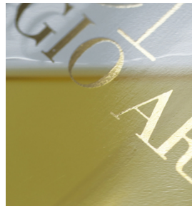
High dense sharp edged letters on perfume flacon with SEFAR PCF FC