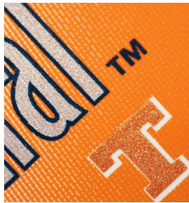
Sharp edged and well readable text on labels printed with SEFAR PCF FC