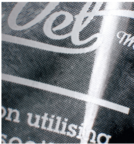
Outstanding printing quality of fine halftones on plastic tubes printed with SEFAR PCF FC

Expand your options with SEFAR PCF for screen printing on plastic containers, labels, glass ware, optical discs and many other challenging print substrates.