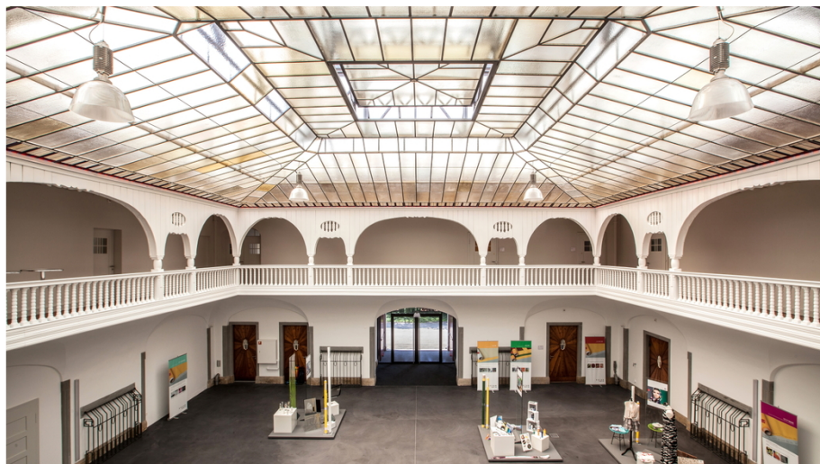
Sefar Competence & Training Center, Screen Printing

The intensive screen printing course covers a wide range of topics, from mesh selection and its impact on the print result, to the intricacies of the stretching process and how to optimize the printing process.