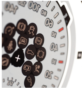
In the fast lane with the highest efficiency and quality printed with SEFAR PME