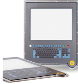
Clear and durable signs and inscriptions printed with SEFAR PME