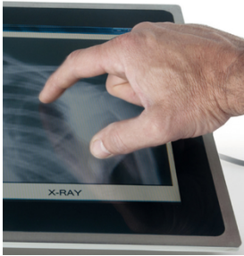
Whether edge masking or protective coatings using SEFAR PME (© Danielson Europe BV)