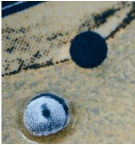
Structured and highly resistant floor tiles with SEFAR PA

SEFAR PA is suitable for applications that require the use of highly abrasive colors and wherever the stencil has to fit to shaped substrates: For example, printing on tiles, plastic or glass containers.