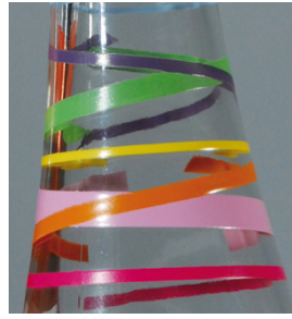
High density and sharp contours with SEFAR PA