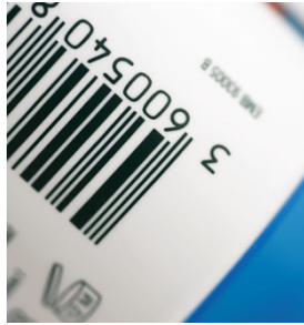
High density sharp edged bar codes printed with SEFAR PA