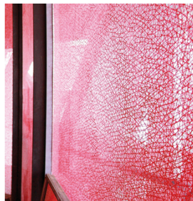
For a precise and durable print image on the glass facade with SEFAR GLASSLINE 68/175-95W