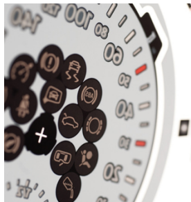
In the fast lane with the highest efficiency and quality printed with SEFAR PME