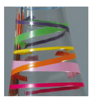
High density and sharp contours with SEFAR PA