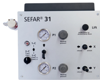
Universal, ergonomic and compact control unit in combination with SEFAR 3A