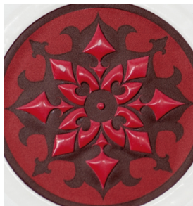
For selected clear varnish on lables, printed with SEFAR PET 1500