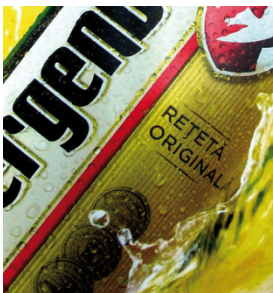
Backlit posters with halftones higher than 30 lines/cm printed with SEFAR PET 1500

SEFAR PET 1500 impresses with its performance in a wide variety of applications, ranging from graphic screen printing in small and large sizes, such as posters, displays, and signage; printing on plastics such as sporting goods, thermoformed parts, etc.; on the decoration of ceramic, directly or indirectly, and on up to textile printing and other industrial printing tasks.