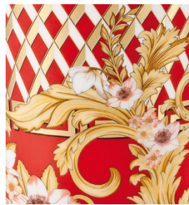
Great detail reproduction on ceramic decals (© Rosenthal) with SEFAR PET 1500